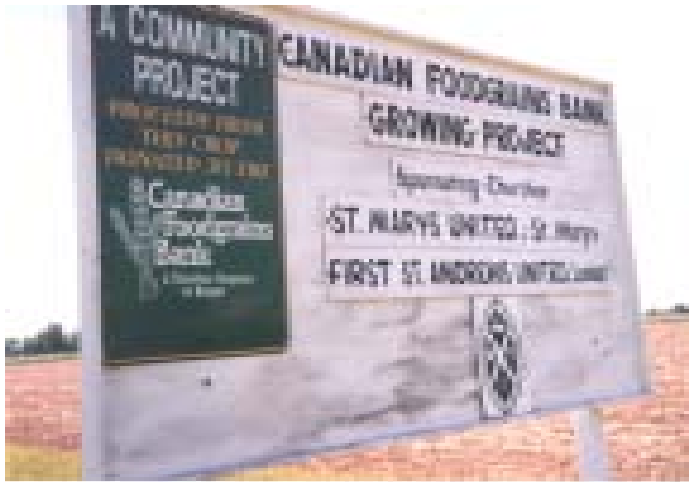
Sign on Highway 7 at stie