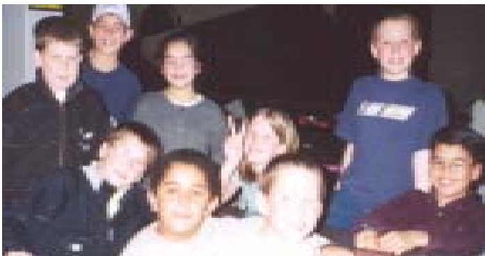
Pop n' Popcorn group goes bowling at Fleetway in November

Girls and boys in grades 5 & 6 are invited to events on Friday evenings about once a month just for fun and friendship.