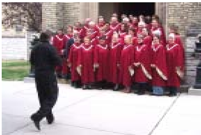
(Above) The Senior Choir poses for the Directory picture