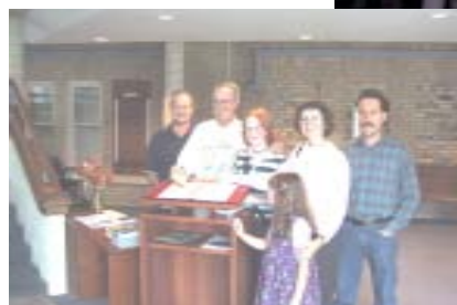
(below) Visitors were greeted at the Atrium Door