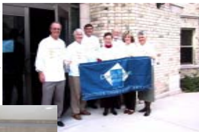
(right) The Sunday "Doors Open Crew"

More than 400 toured our sanctuary and building.