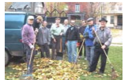
More than a dozen helpers showed up the the annual Fallcleanup.