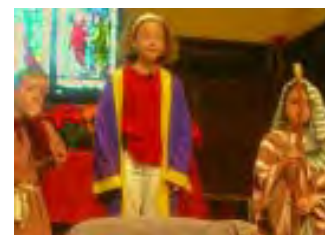
Away in a Manger