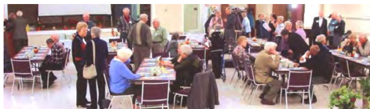
Supper Club, October 24, 2007

Go down to Proudfoot Hall and celebrate!