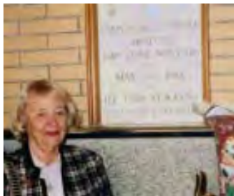
Author in front of Government hospital, built in 1914