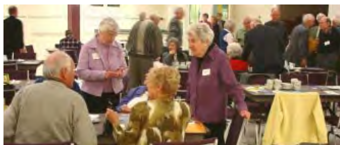
Supper Club, October 24, 2007