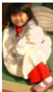
The littlest Angel