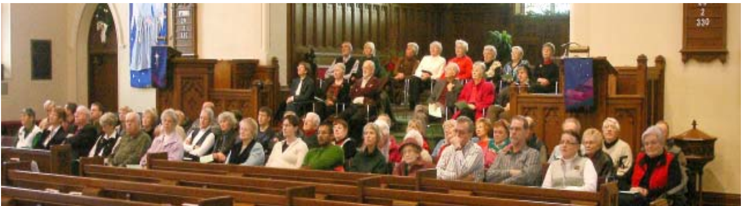
Organ Recital December 15, 2007