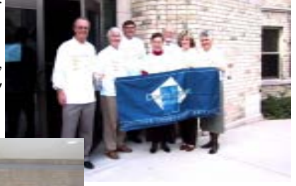
(below) Visitors were greeted at the Atrium Door